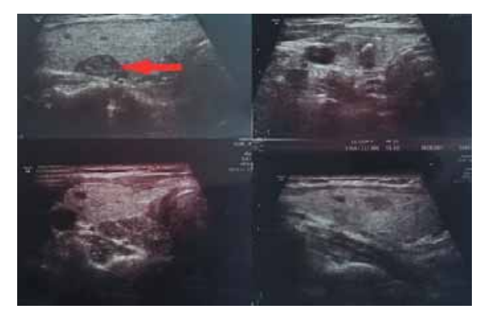
Fig. 2. Ultrasound examination of the thyroid gland. The arrow shows the intrathyroid localization of the parathyroid adenoma surrounded by thyroid tissue. On the right picture - colloidal nodes of the same lobe of the thyroid gland.